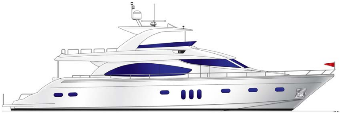
JOYCE 80' classic MOTORYACHT, DELIVERED F.O.B TAIWAN